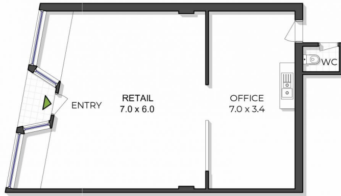
RETAIL GROUND LEVEL FLOOR PLAN